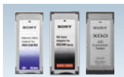
MEAD-MS01/SD02 QDA-EX1 Media Adapters for MS/SD Card and XQD