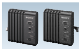
CBK-WA100/101 Wireless Adapter