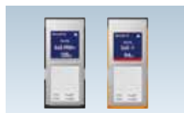
SxS Memory Card Series