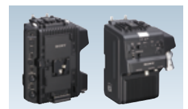
CA-FB70/TX70 System Camera Configuration Units